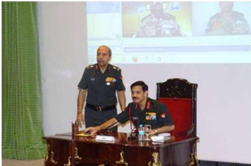
Fig 1 – Launch of PeopleLink Video as a Service by COAS at Indian Army Headquarters

The Indian Army was evaluating Visual Collaboration Solutions for connecting with their remotely based commands. This Comprehensive Video network was required to be operational even at Low Bandwidths, considering the distinct and difficult terrains on which the forces operate.